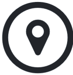
Get location coordinates with Google maps