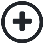
Set custom pattern to QR codes