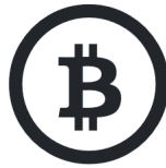
BitCoin payment option

Generate your personal QR Code in few clicks!